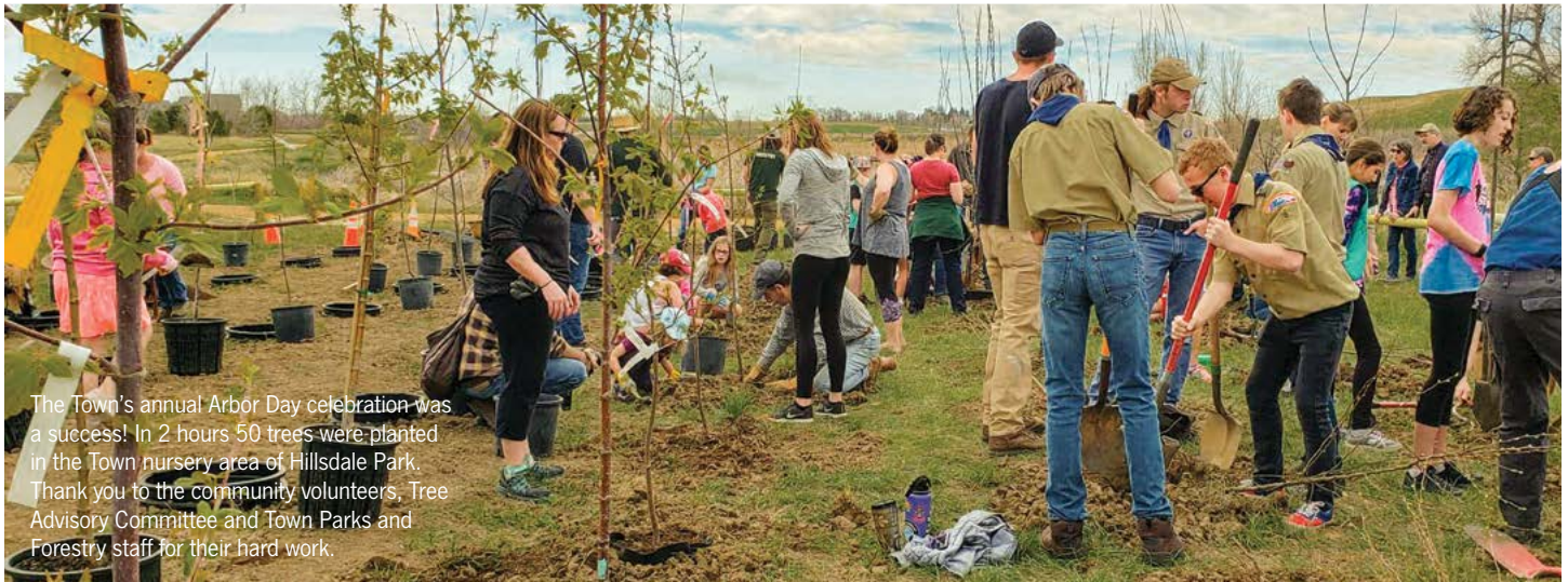
The Town's annual Arbor Day celebration was a success! In 2 hours 50 trees were planted in the Town nursery area of Hillsdale Park. Thank you to the community volunteers, Tree Advisory Committee and Town Parks and Forestry staff for their hard work.