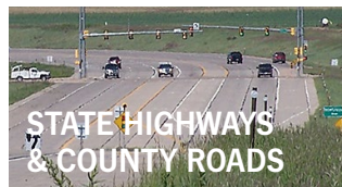
STATE HIGHWAYS & COUNTY ROADS

The Town of Berthoud is responsible for snow and ice control on municipal streets within Town limits. The goal of the team is to maintain safe traffic movement, so the first priority is clearing school routes, main roads and any ambulance streets that carry heavier traffic. Residential and low-traffic streets are second priority, and are cleared when resources are available.