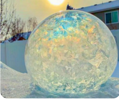
Ice Bubble