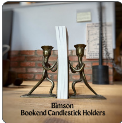
Bimson Bookend Candlestick Holders

Get more information on their website - berthoudhistoricalsociety.org