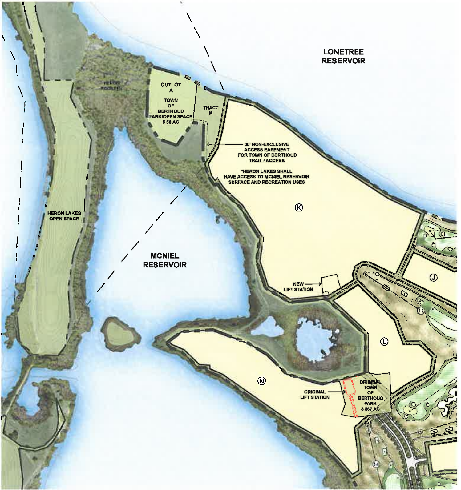
HERON LAKES - TOWN OF BERTHOUD PARK / OPEN SPACE 3.17.16